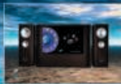
DVD Laser Lens Cleaner