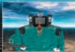
ProLogic Check of Audio Channels