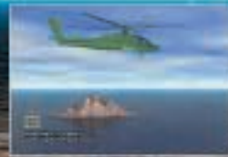
Video With 5.1 Channel Dolby Digital Surround Sound