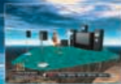
Audio Frequency Response Check