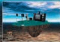
5.1 Channel Check of Audio Channels